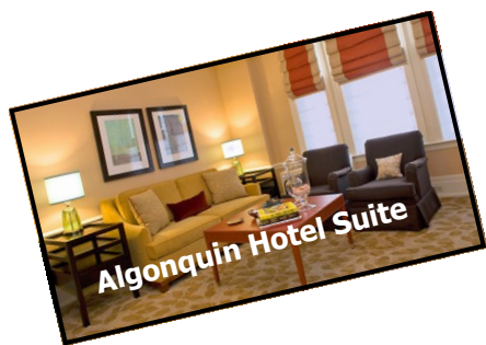
Algonquin Hotel Suite

West Coast travelers should plan to arrive Tuesday, May 29th. Ask about the additional costs.